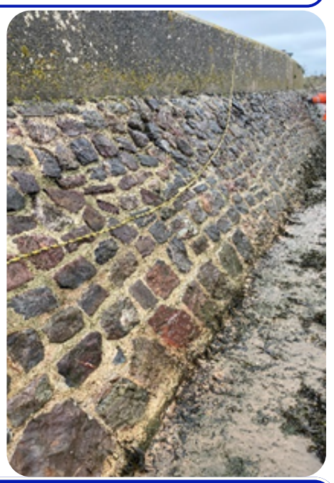
Client: East Devon Council